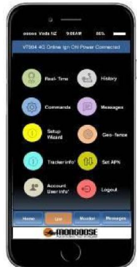
'Account' User Menu

'MESSAGE' – Shows text messages that have been sent to your mobile phone.