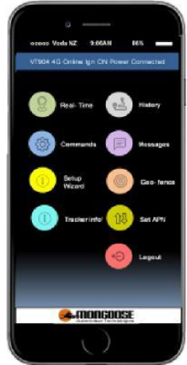
Single User Menu