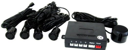
Front & rear parking sensors