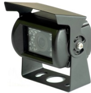
Heavy duty cameras