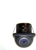
A wide range of cameras