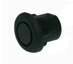
Rubber sensors for metal bumpers