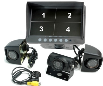
4 cameras – 1 display monitor See 'large vehicle systems'