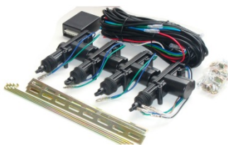
4 door Central locking motor kit