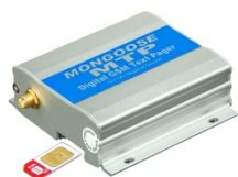
MTP4 GSM text pager