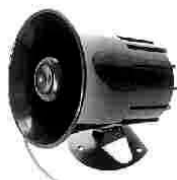
MSB1000 Standard siren