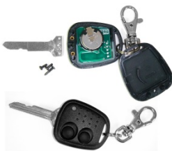
M40 The ignition key (plain metal type) can be adapted to fit into the remote control