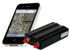
VT404 GPS tracker